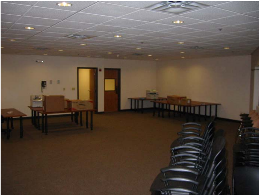
Description: Training Room looking north. Completed with carpet, paint, doors, frames, electrical, fire system, ceiling tiles, insulation, base molding.