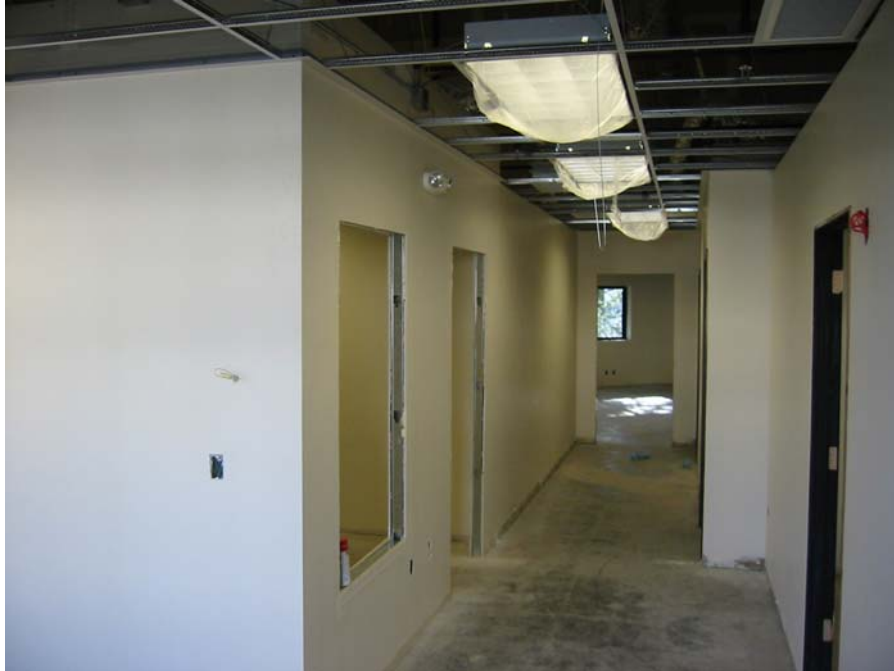
Description: Office Hallway. After new metal stud walls, drywall, tape, mud, tape, first coat paint, grid ceiling, recessed parabolic light fixtures, HVAC system.