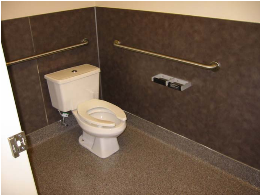
Description: Bathroom. Complete with re-used existing toilet, new wainscot, sheet vinyl flooring, bathroom accessories and ADA grab bars.