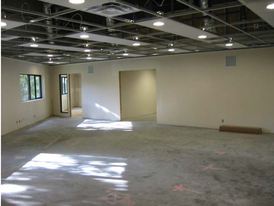
Description: Training Room looking south. After new metal stud walls, drywall, mud, tape, first coat paint, grid ceiling, can light fixtures, HVAC system.