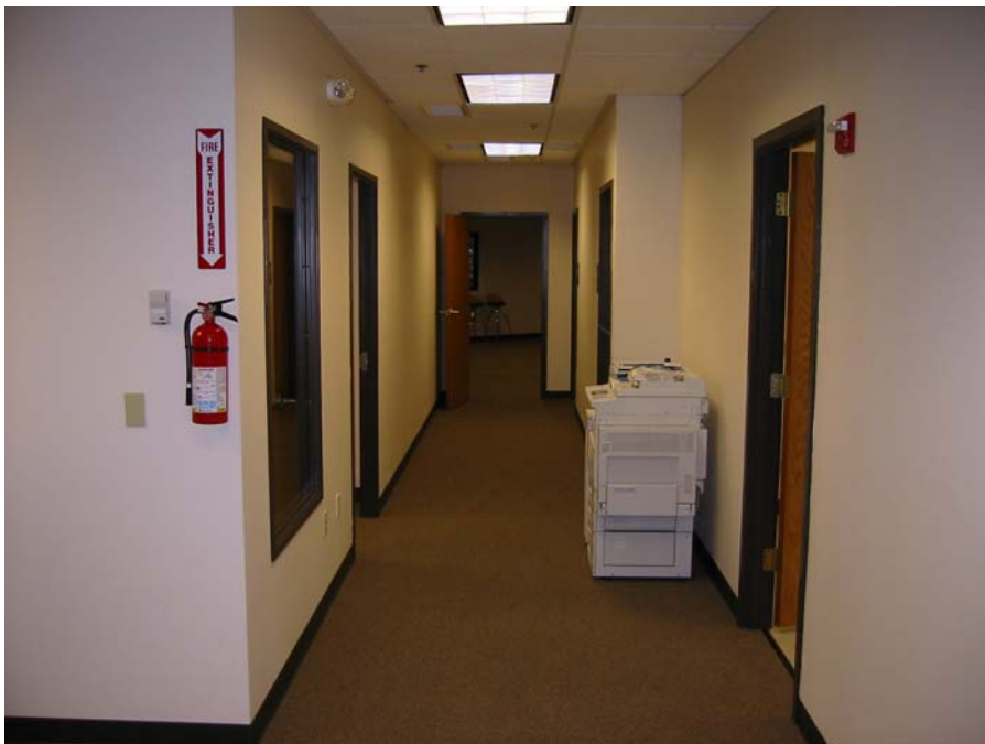
Description: Office Hallway. Completed with carpet, paint, doors, frames, electrical, fire system, ceiling tiles, insulation, base molding.