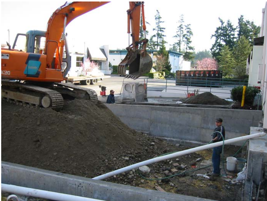
Description: New Dock High Doors. New spread footing formed, dock well walls formed, dock leveler pits formed.