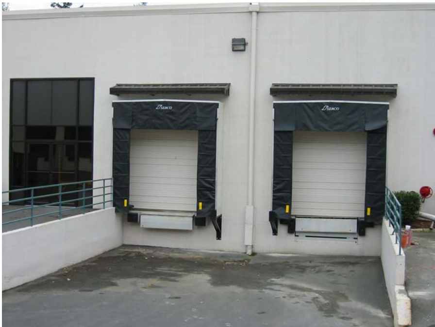
Description: New Dock Shelters on old dock.