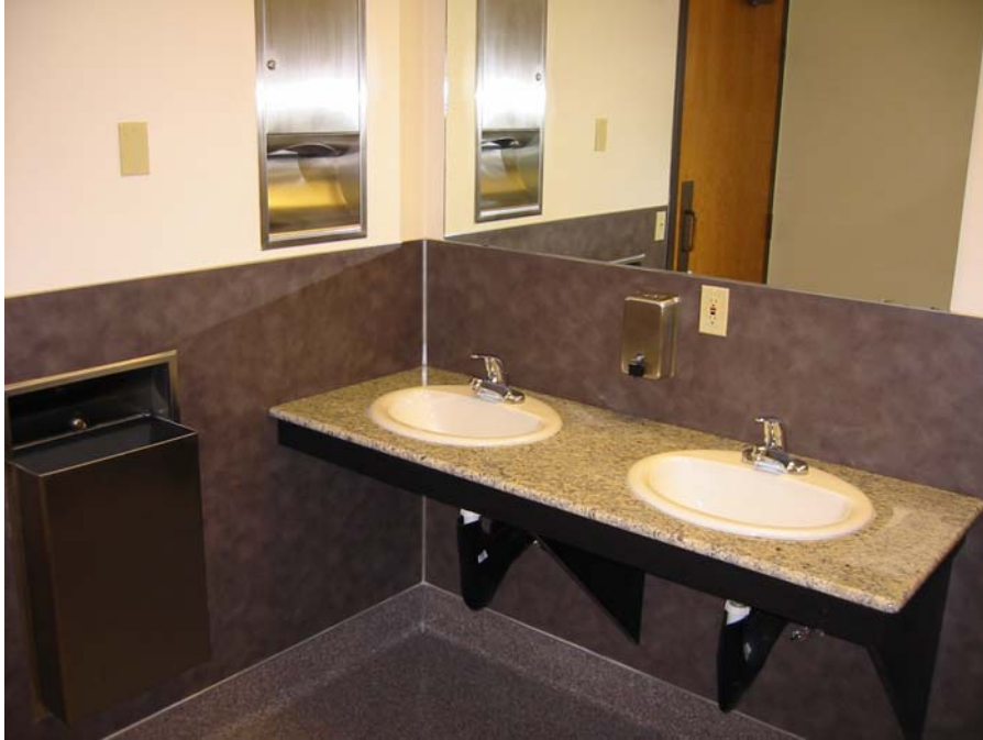
Description: Bathroom. Complete with wainscot, sheet vinyl flooring, bathroom accessories, new sinks and a ADA granite countertop.