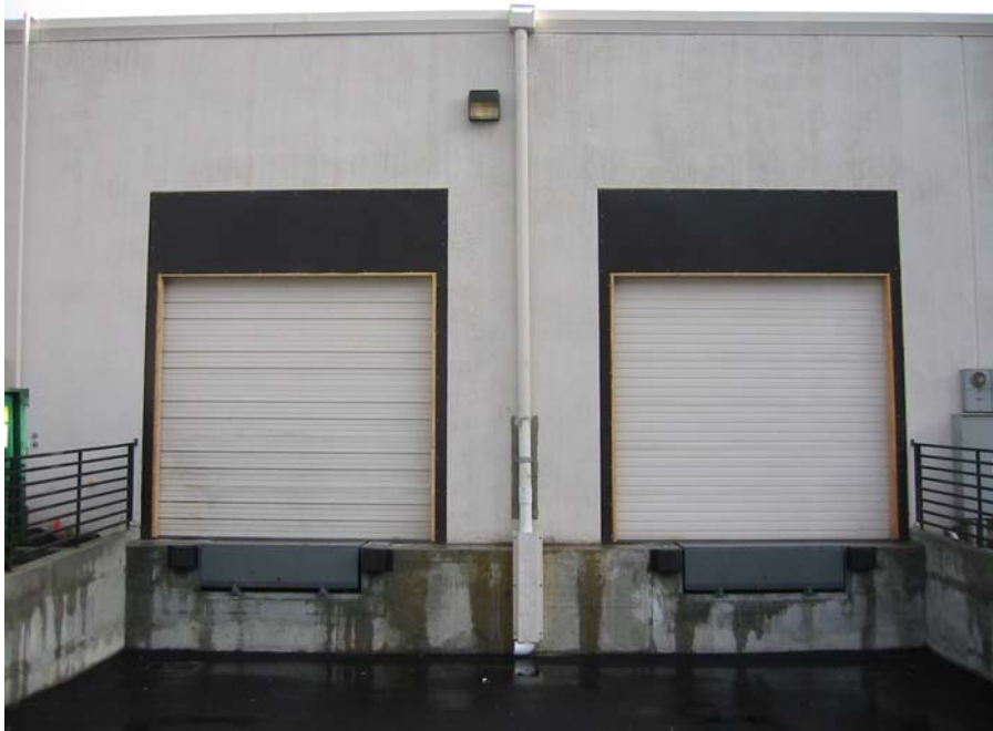
Description: New Dock High Doors. Custom made sheet metal covers for exposed framing. Caulked edges for weatherproofing in the reveal.