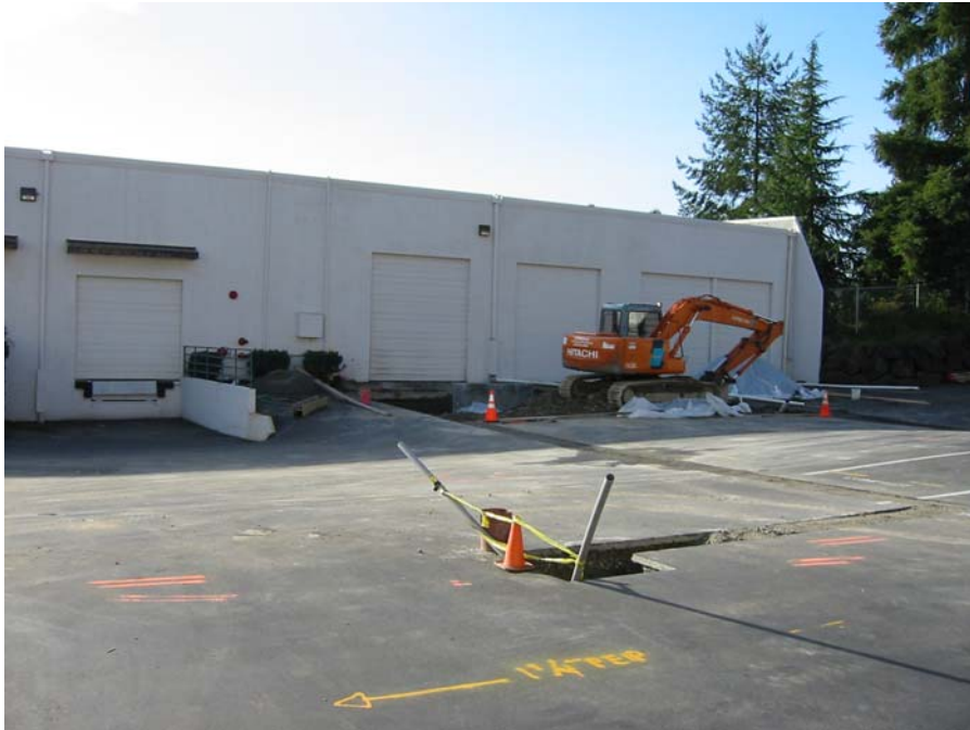
Description: New Dock High Doors. Saw cutting asphalt and excavation complete.